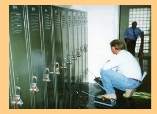
EPA testing air in a school following a mercury spill

If there is a spill the area should be evacuated quickly and cleaned up properly.