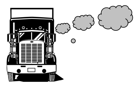
This pollutant can make allergic responses more severe.