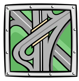
People living near here have a greater risk of developing asthma.