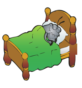
Using these reduces your exposure to dust mites in bed.